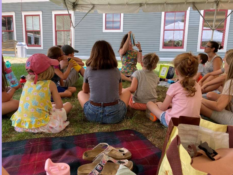
Picnic with the Principal on the WCS Playground